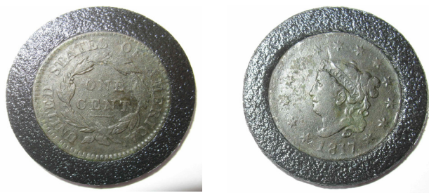
1817 LARGE CENT FOUND IN UPPER CT BY JOHN LOZITO

YOUNG DEFENDERS LEAGUE PIN FOUND BY ALLYSON COHEN