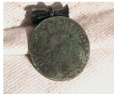
CONNECTICUT COPPER FOUND BY JIM BYRNE