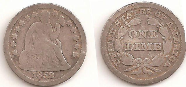
1852 DIME FOUND BY SEAN SHAUGHNESSY