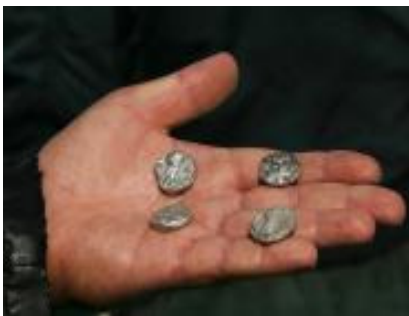
A Palestinian man holds ancient silver coins recently discovered near the Egyptian border town of Rafah

Officials said the device was transported to the Mountain Home Air Force Base for destruction.