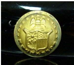
PRE-CIVIL WAR BUTTON FOUND BY PAT D'ARINZO