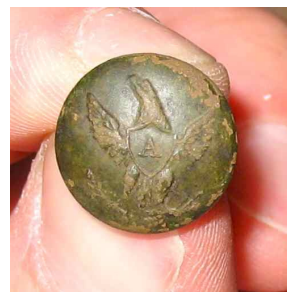
CIVIL WAR BUTTON FOUND IN LOWER WESTCHESTER PARK BY JOHN LOZITO

COPPER FOUND BY ALLYSON COHEN & PAT D'ARINZO IN RIDGEFIELD, CT