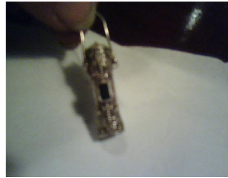
COLONIAL RAZOR AND PRAYER HOLDER FOUND BY CAMILLE LAHR