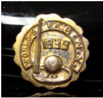
1939 WORLD'S FAIR PIN FOUND BY PAT D'ARINZO