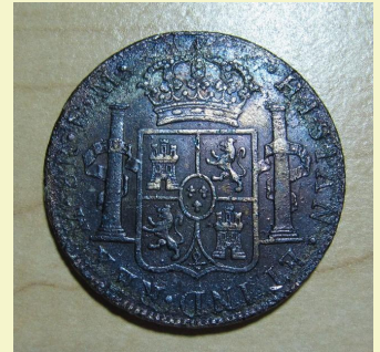
THE 1777 KING CAROLUS III 8 REALE SILVER FOUND BY WOODY FROM THE SOUTHEASTERN PENNSYLVANIA HISTORICAL RECOVERY GROUP (SPHRG)