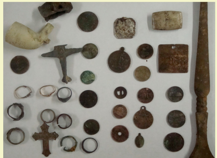
HARRY BARRON FOUND A NICE COLLECTION OF RINGS, MEDALS AND A NEAT PIPE