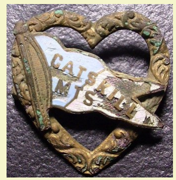
CATSKILL MOUNTAIN PIN FOUND BY CARTER PENNINGTON