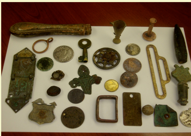
NICE BATCH OF FINDS FOUND BY FRED DELISE