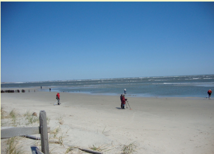
With the morning came the sunshine!