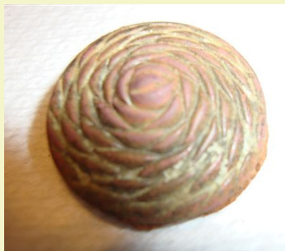
BUTTON FOUND BY DENNIS LURIA