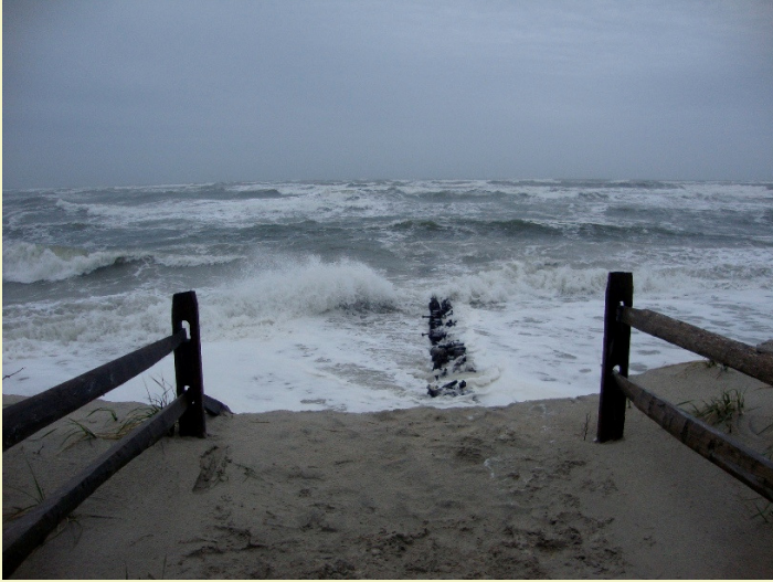
It was quite the storm

It was evident by the amount of cars lined up on the roadway to the beach, with their occupants waiting out the storm, that this site was no longer a secret.