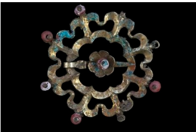
Ancient Brooch Found In Austria

and other objects that were adorned with pearls, coral fossils and other ornaments.