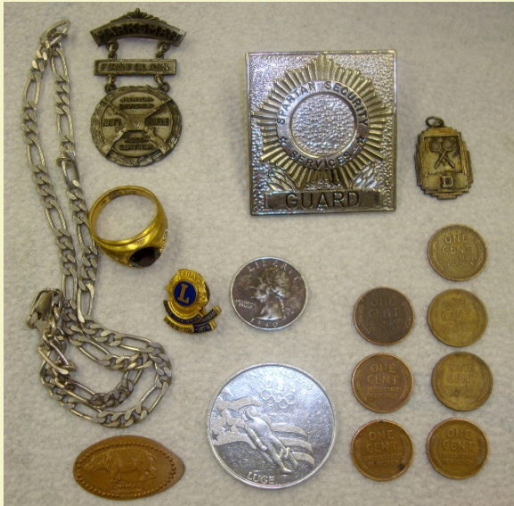
MEDALS, COINS & JEWELRY FOUND BY TOM RATEL