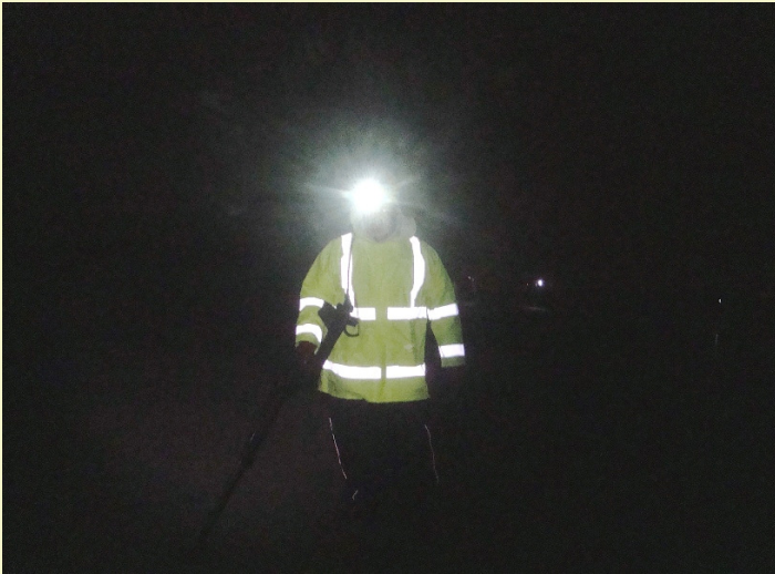
Fred DeLise hunting by head lamp after the storm—and they call us detectorists obsessed? I don't get it.