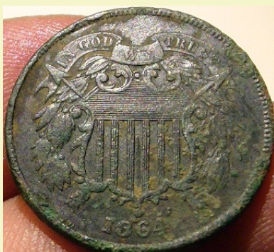
1864 TWO CENT PIECE FOUND BY CARTER PENNINGTON