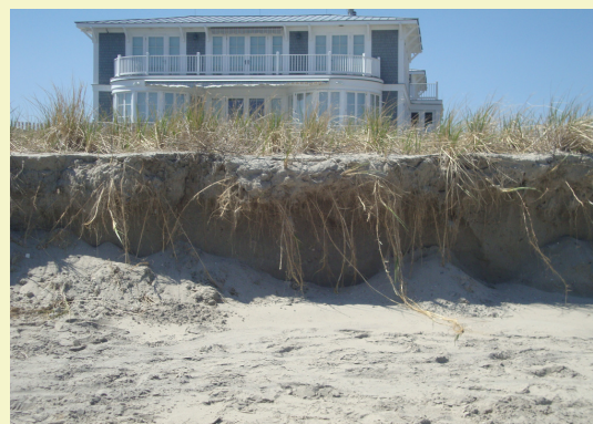
Beach erosion at the site